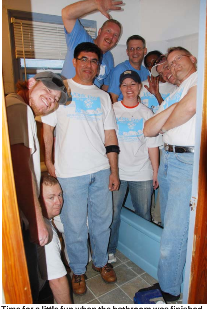
Time for a little fun when the bathroom was finished.