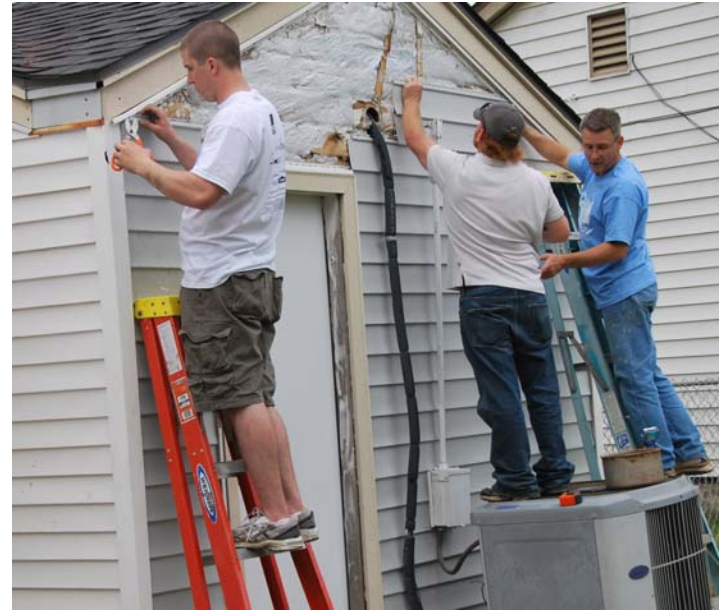
Hail-damaged siding had to be removed and replaced.