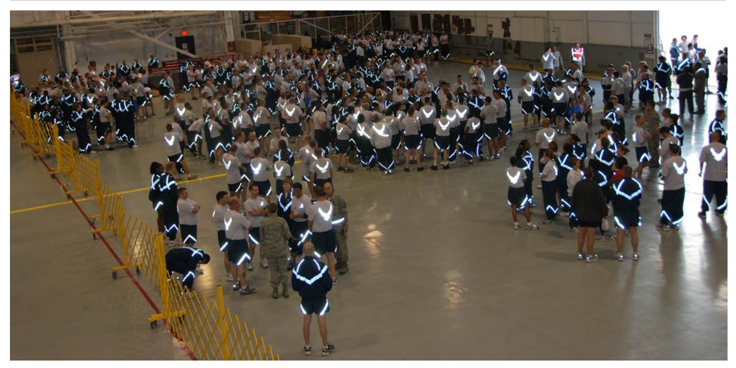
Wing members prepare for the May UTA Fun Run